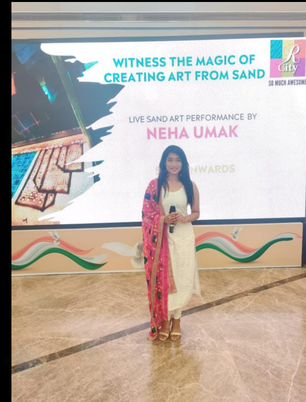
R City Celebrating Republic Day