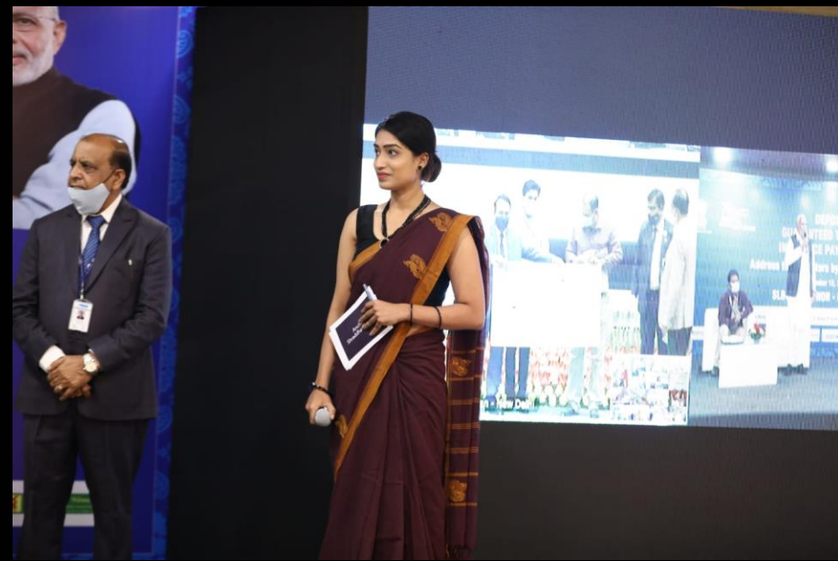
Bank of Maharashtra Event for Virtual Address by Hon. Prime Minister Narendra Modiji for Bank Account Holders