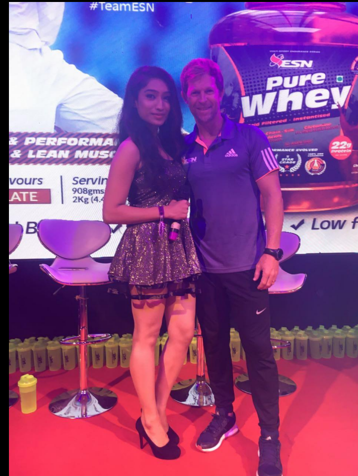
Body Expo for ESN by Jonty Rhodes