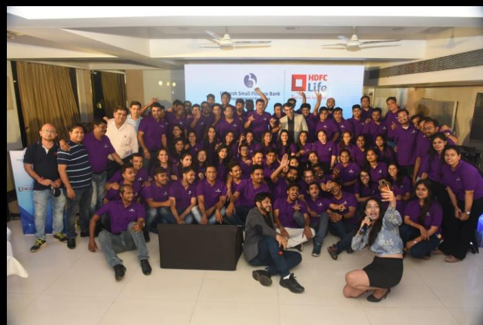
Utkarsh Small Finance Bank X HDFC Life