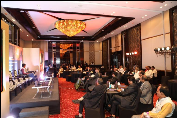
J&K Travel Trade & Press Conference