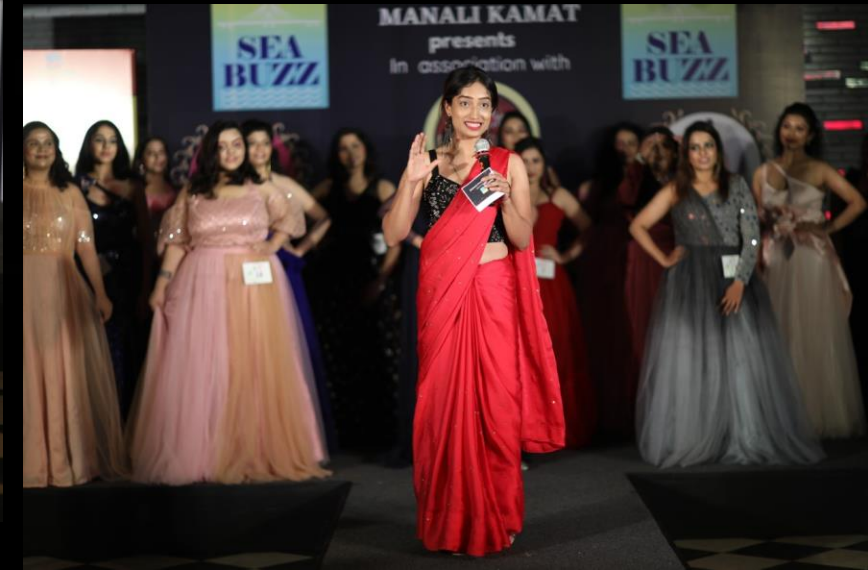
Sea Buzz Dadar Beauty Pageant