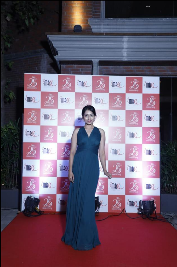
MRCC Red Carpet Host