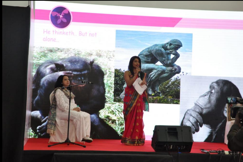
MHRD Cancer Awareness Event