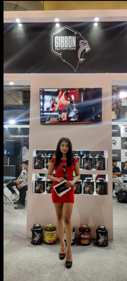
IHFF for Gibbon Nutrition