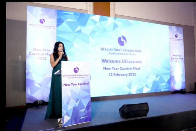
Utkarsh Small Finance Bank X ICICI Pru