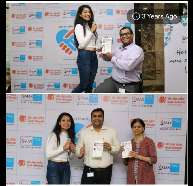
Bank of Baroda Event