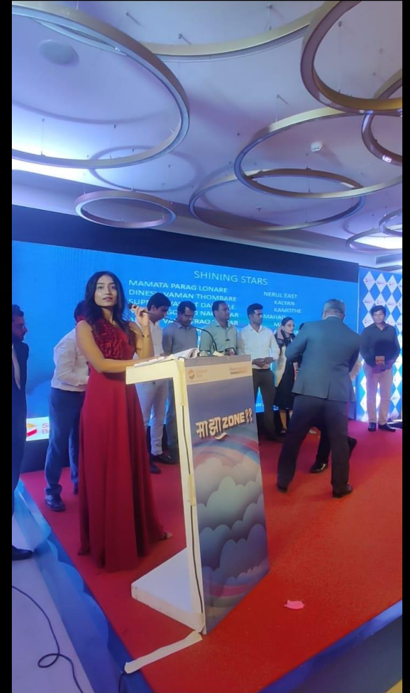
ICICI Pru X Saraswat Bank